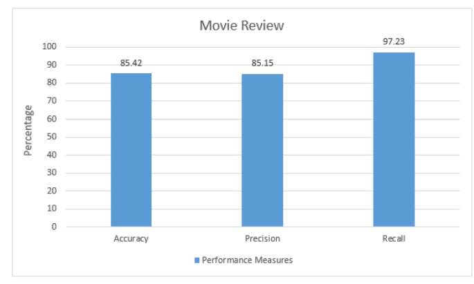
Figure 6. Performance of Proposed System