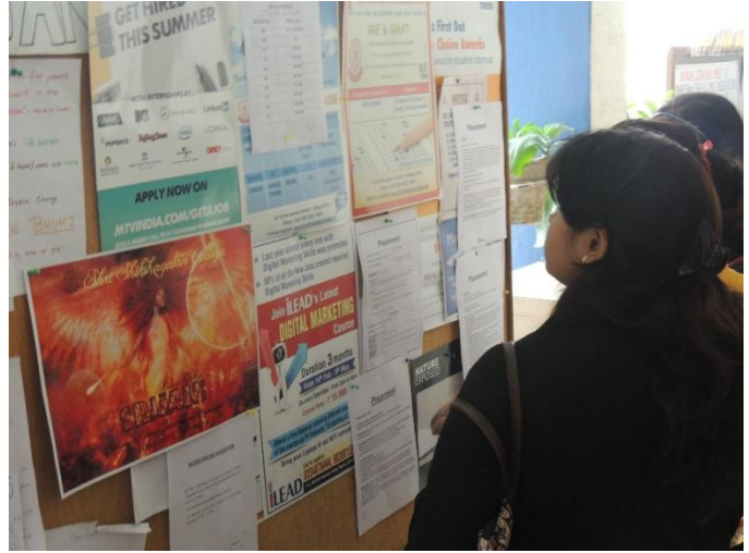
A. The Manual Wooden System

We intend to run the DNB as a program that can be viewed strictly within specific locations. For the fact that the notice board program runs on personal computers connected by a local area network, information dissemination is efficient.