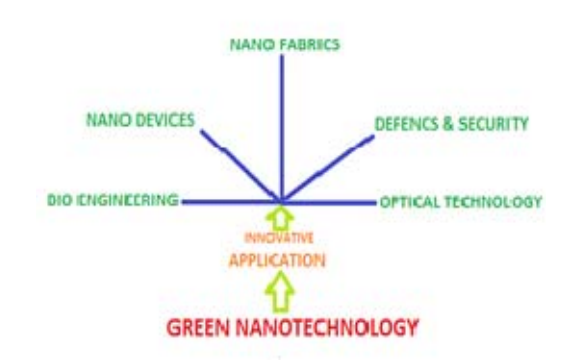
Figure 1.Application of nanotechnology

Reducing the generation of pollution at the source, minimizing the risk to human health and the environment [1]. Nanotechnology improves the quality of process which leads to the development of different fields. A huge amount of research and development activity has been devoted to Nano-scale related technologies in recent years. The National Science Foundation projects nanotechnology related products will become a $1 trillion industry by 2015[2.]. The concept of using Nano-fluids as a means of improving coolant performance was proposed over a decade ago[3]. Reports of up to 100% increase in liquid thermal conductivity with the addition of nanometre scale particles motivated a large amount of scientific/technical inquiry in the ensuing years