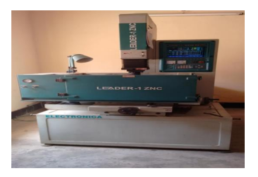
Fig 3.8: Electro discharge machine