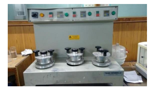
Fig 3.1: Ball Planetary Mill

Copper powders were mixed with alumina particles to form a mechanical mixture of Cu-alumina powder comprising 90% of Cu powder and 10% of Al2O3 powder by weight to form a composite of 15 gram each. Blending of powders was accomplished in ball planetary mill (Model- PULVERISETTE-5, Make-FRITSCH, Germany) shown in Fig 3.1. It consisted of three cylindrical containers made up of chrome steel within which 10 balls made up of chrome steel of sizes 10 mm. To achieve a homogenous distribution of the reinforcement in the mixture the blending machine was set up for 2 Lakh revolutions.