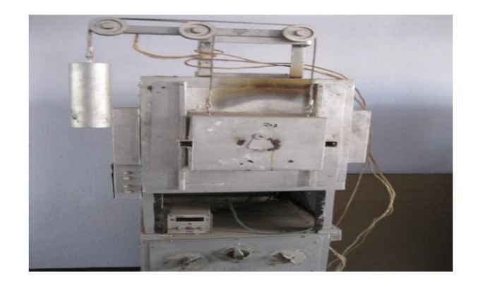
Fig. 3.6: Heat Treatment Furnace

After sintering the samples were then solution heat treated in a heat treatment furnace (local made) as shown in Fig. 3.6. Quenching was carried out at a temperature of 500 0C for a span of one hour and then quenched in iced water.