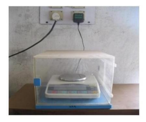
Fig 3.2: Electronic weighing machine

Mixing was followed by weighing the samples in an electronic weighing machine. Batch of nine samples were prepared keeping the weight of each of them as 10 grams.