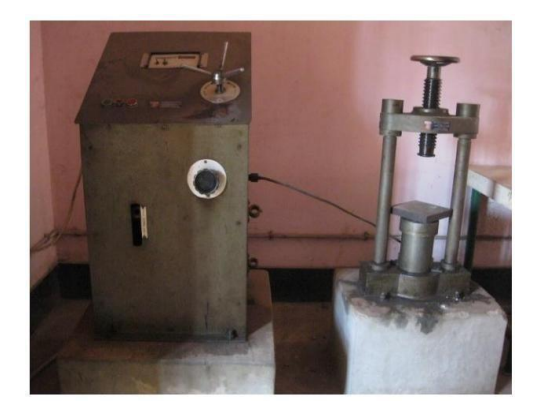
Fig 3.3: Cold Uniaxial Pressing Machine