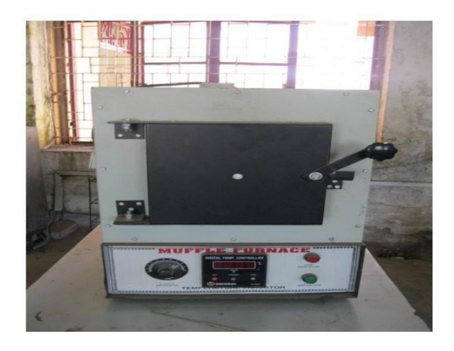
Fig. 3.7: Closed Muffle Furnace

All samples were aged at temperature of 2000C for span of eight hourand allowed to cool in it to room temperature.