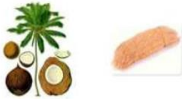
Fig. 1. Coconut Tree, Coconut and Coconut fibres