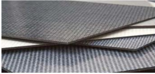
Fig-1.1: Composites are formed by combining materials together to form an overall structure that is better than the sum of the individual components

The first level of classification is usually made with respect to the matrix constituent. The major composite classes include Organic Matrix Composites (OMCs), Metal Matrix Composites (MMCs) and Ceramic Matrix Composites (CMCs). The term organic matrix composite is generally assumed to include two classes of composites, namely Polymer Matrix Composites (PMCs) and carbon matrix composites commonly referred to as carbon-carbon composites.