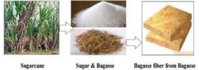
Fig-1.3: Figure of bagasse fibre

Chemically, bagasse contains about 50% \alpha -cellulose, 30% pentosans, and 2.4% ash. Because of its low ash content, bagasse offers numerous advantages in comparison to other crop residues such as rice straw and wheat straw, which have 17.5% and 11.0%, respectively, ash contents, for usage in microbial cultures. [6].