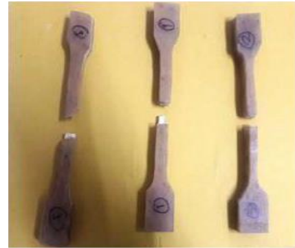
Fig-3.2: Specimen after Fracture