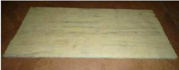
Figure 2(f): Hybrid Composite Sheet