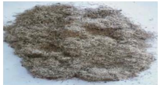
Fig-2 (b): Bagasse fibre