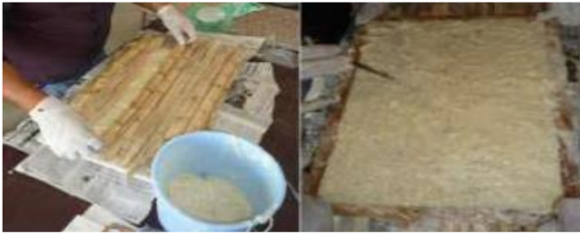
Fig- 2(e): Fabrication process