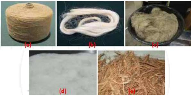
Fig-1.2: (a) Jute yarn (b) Sisal fibre (c) Hemp fibre (d) Cotton fibre (e) Coir fibre