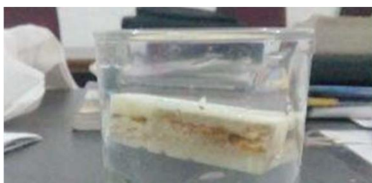
Fig-3.4: Water Absorption Test

A rectangular test piece of dimension (60mm×40mm×10mm) was dipped in a glass containing water 250ml for 36 hrs. Initial weight of the specimen was 25 g measured by the weighing balance (manufactured by Ohaus) whose least count is 0.01g. The weight of the specimen was measured at a time interval of 6 hrs till 36 hrs. The specimen absorbed water only upto 24 hrs. The specimen weight increased upto 0.55g in 24 hrs only and after that the specimen weight shows that there is no increase in weight that is specimen weight is constant. After 24 hrs, the samples were taken out from the moist environment and all surface moisture was removed with the help o-f a clean dry cloth or tissue paper.