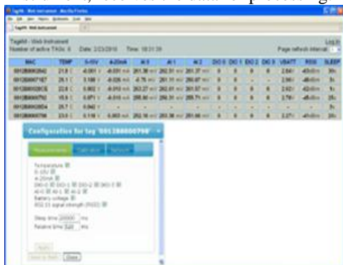
Figure 4: Web Page Instrument

between the sensor or actuator and the A/D or D/A front end located on a 'sensor tag,' which sends or receives data and commands to or from a commercially available wireless access point (AP) or router as shown in figure 3. Further, instead of the data being sent to a particular computer, it sends the data to an AP for further routing to an Internet IP address that defines a Server ID. A user-controlled web-based application server, or Web Page Instrument, receives the data for processing.