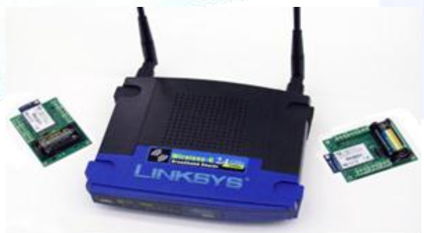
Figure 3: Sensor Connection and access point

RFID technology is popular due to reduced cost and size. Also, the existence of web-based applications helps this new technology in better way. In this new concept known as the Instrumentation Cloud, the only physical connection is