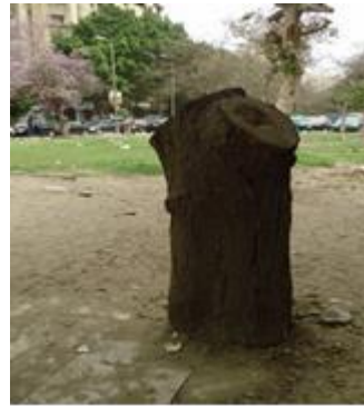
Figure (13): These images show logging the trees of age more than 20 years diameter of more than 25 cm, which distorted the overall composition of the streets and public parks.