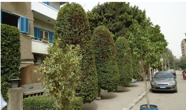
FIGURE (12): We Note The Pruning Of Trees In An Engineering Ways That Contrast To The Nature Of The Neighborhood In Contrary To The Laws Concerning To Reforestation Of The Area.

• It is prohibited to prune trees in public spaces in geometric shapes contrasted with the natural view of the suburb. The pruning shall be limited to removing the infected or damaged branches to maintain the balance of the trees to prevent harmful interference. Figure No. 12/13 shows the unfair pruning of trees and its negative impact on the quality of life.