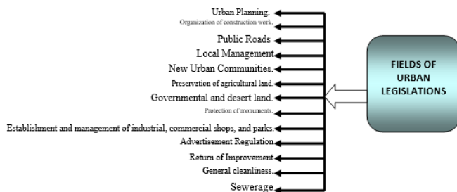
Figure (1): Urban areas of legislations