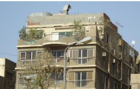
Figure 4 shows non-law commitment and its reflections on the lack of quality of life.