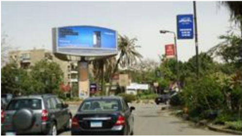
Figure (3): The distortion of optical image as a result of the presence of ads in the squares.

spaces but after obtaining a license from the competent administrative authority and after the approval of the national agency for Coordination of civilization.