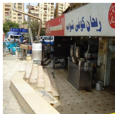
Figure (7): It shows shops for the sale of food causing a smelly emission that hurt the next house.

Giving licenses to contaminated harmful uses such as workshops, warehouses and shops is not allowed at distinguished real estates, except in places designed for that originally. Figure 7 shows non-compliance to uses determined for areas and bad impact on quality of life.