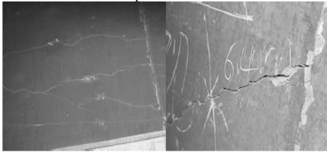
Figure 1 lining crack of a tunnel (Mined out area in the low of the tunnel)

Lining cracks mainly appears in the area of low foundation bearing capacity, the rock crushing, loess area and mining coal, as shown in figure 1. Cracks in tunnel lining, the increasing number and width of cracks will soon affect the safe operation of the tunnel.