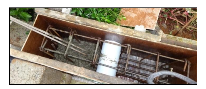
Fig. 3. Concreting for deep beam

Fig. 2. Shuttering and placing of reinforcement cage for deep beam