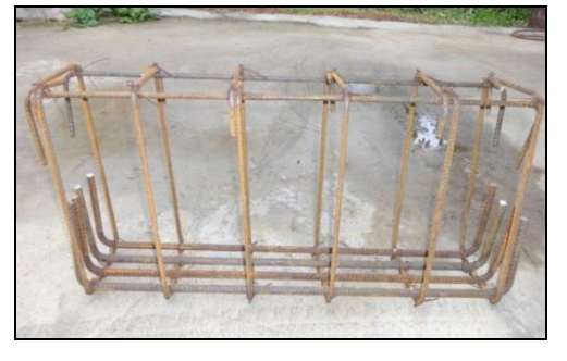
Fig. 1. Reinforcement cage for deep beam